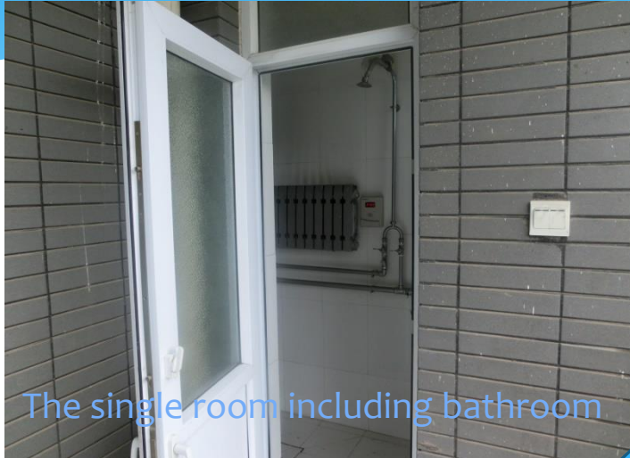
The single room including bathroom