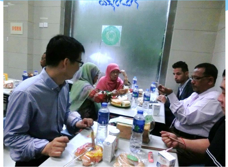
Specific restaurant for muslim students in the campus