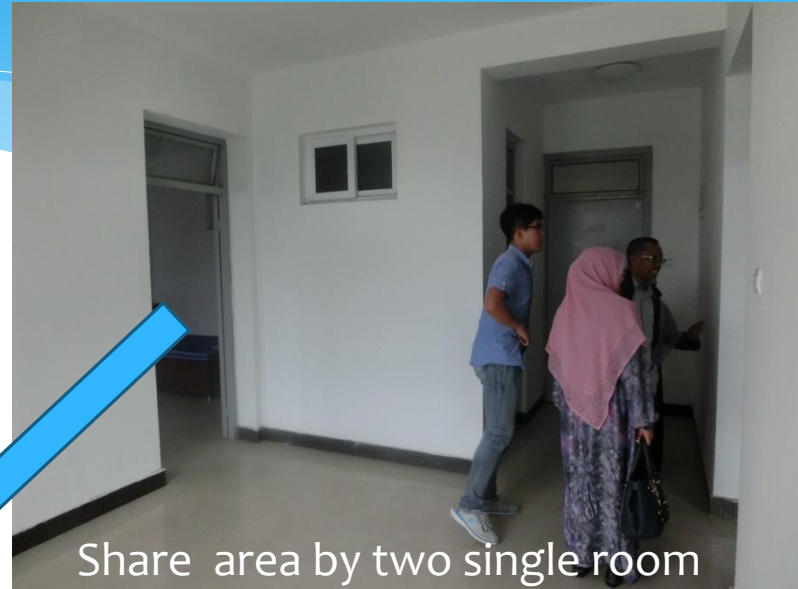
Share area by two single room